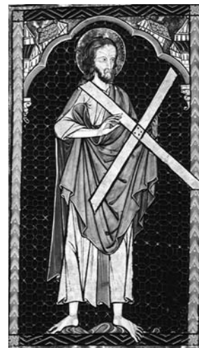
Saint Andrew from a 13th Century Psalter. His feastday is November 30 th .